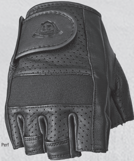
Half Jab Perf